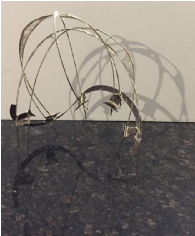
Homage to Kandinsky