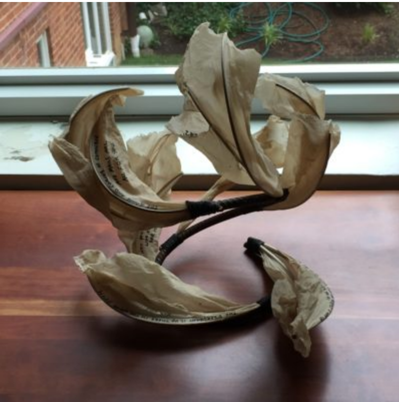
Leaves of Grass- Not for him