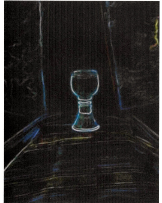
Jubilee 2016 There Is Still a Vision

SEEKERS CHURCH A Christian Community In the Tradition of Church of the Saviour