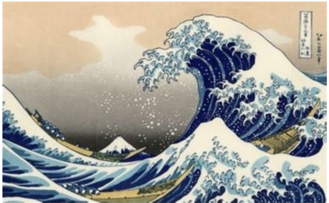
Image adapted from Hokusai (1760-1849). "Under the Wave off Kanagawa"

SEEKERS CHURCH A Christian Community In the Tradition of Church of the Saviour Lent 2018 The Foolishness of Faith