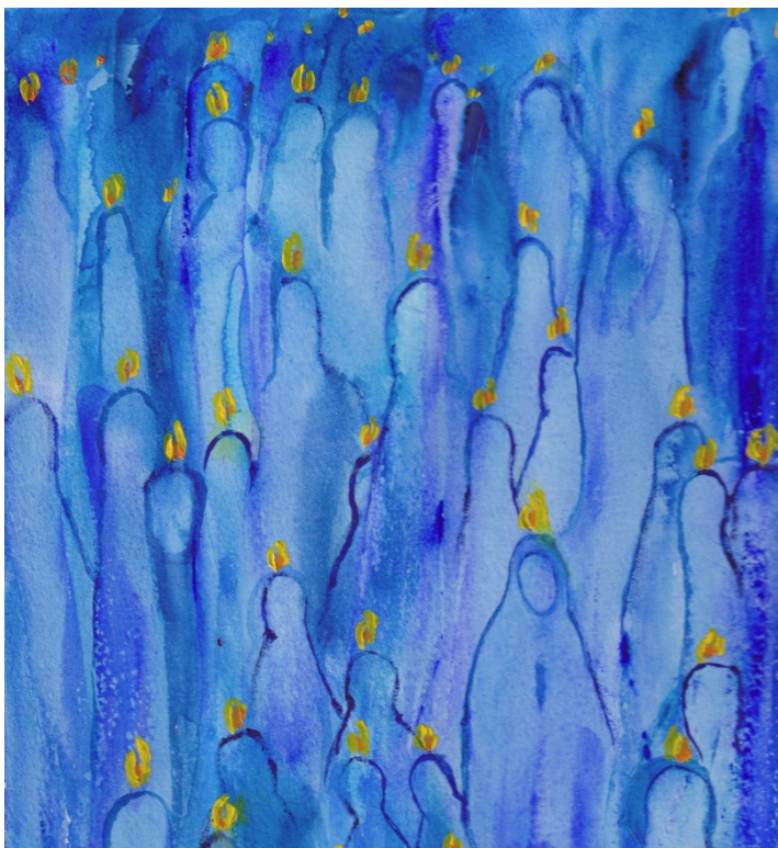
“Pentecost” watercolor by Jacqie Wallen