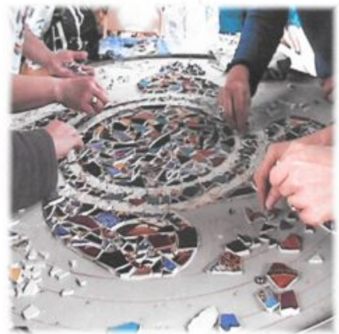
Season After Pentecost 2016 Thank God We're in This Together

SEEKERS CHURCH A Christian Community In the Tradition of Church of the Saviour