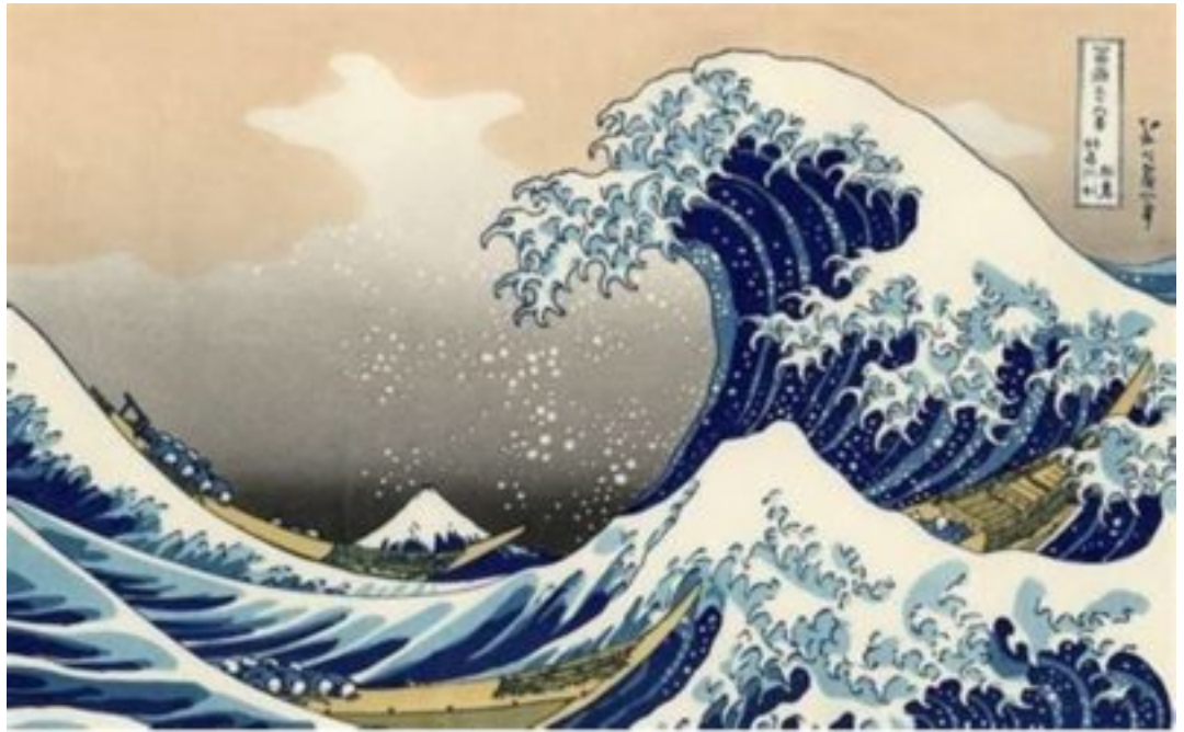
Image adapted from Hokusai (1760–1849) "Under the Wave off Kanagawa"

SEEKERS CHURCH A Christian Community In the Tradition of Church of the Saviour Lent 2018 The Foolishness of Faith